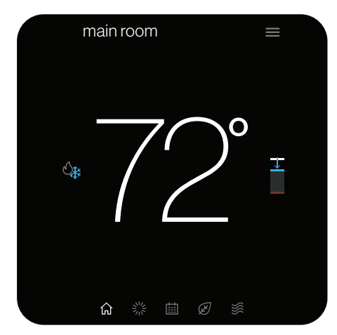
The home screen displays the current temperature, the current system mode, and icons leading to each of the top level screens.