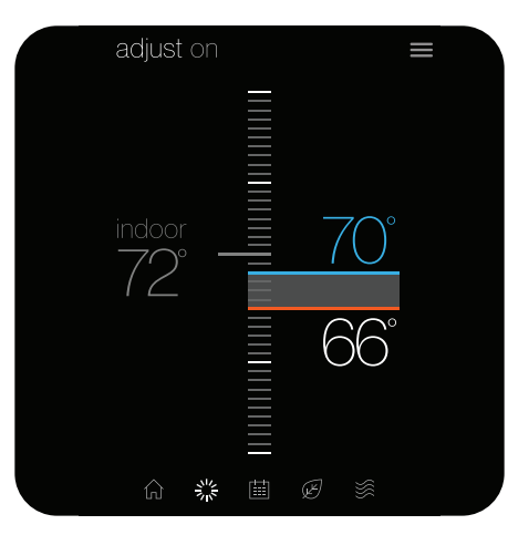
The adjust screen displays the current temperature on the left and set-points on the right. Change the set-points by dragging them or by turning the dial.