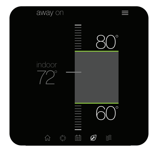
The away screen displays energy saving set-points. Energy saving can be invoked manually or automatically when the mobile app recognizes everyone is away.